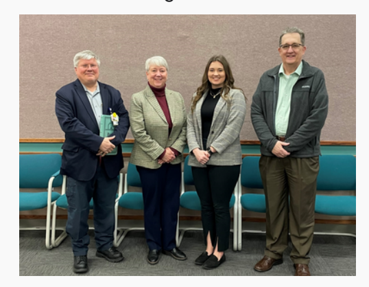
SULLIVAN COUNTY REGIONAL HEALTH DEPARTMENT

public the larger health department in Tennessee, the Sullivan County Regional Health <u>Department</u> to support them in their journey to move from trauma aware to trauma competent. At our celebration event this past spring, local media attended, resulting in my health department friends making the front page of the newspaper the next day sharing their outstanding achievements.